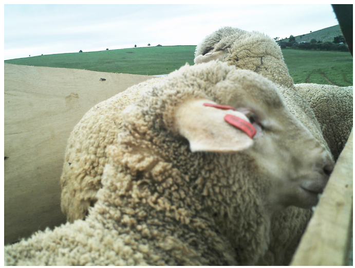
Above – Sheep fitted with the RFID ear tag

Data collection can take time and the costs and benefits need to be considered before implementing the system'.